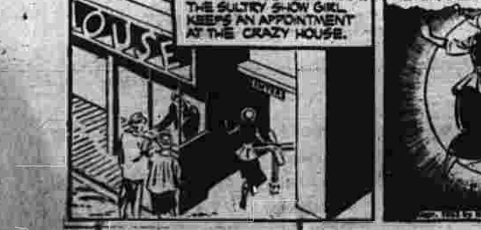
BY AL VERMEER