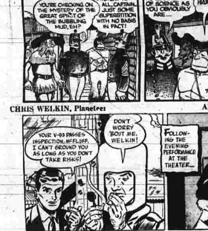
BY AL VERMEER