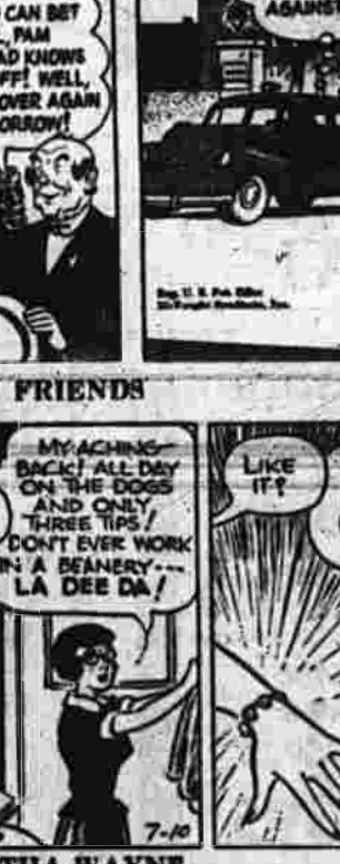
BY AL VERMEER